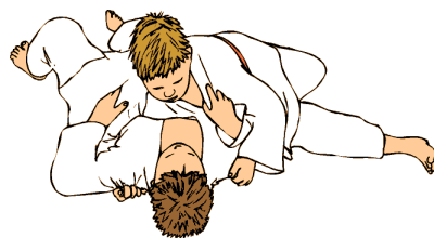
Kuzure Kesa Gatame (Modified Scarf Hold)