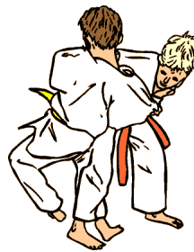
O Soto Otoshi (Major Outer Drop)