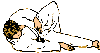
Yoko Ukemi (Left & Right Side Breakfall)