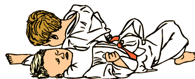
Kesa Gatame (Scarf Hold)