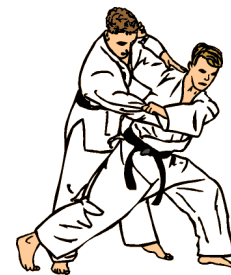
Tai Otoshi (Body Drop)